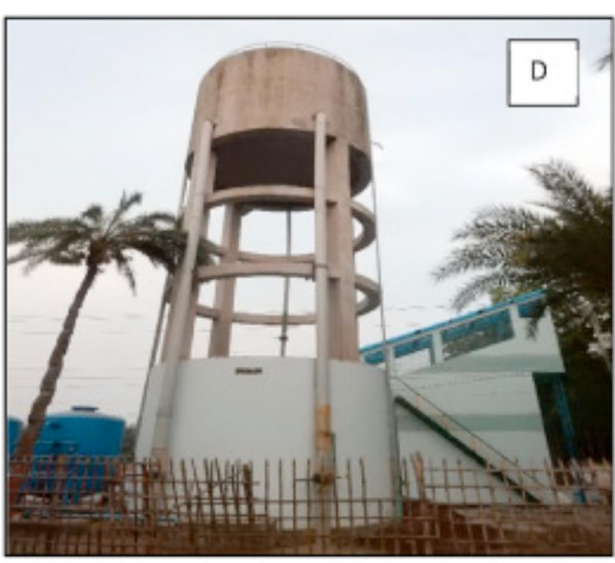
Figure.2. Different drinking water sources in the study areas (A: Collection of pond water for drinking; B: Plastic container for rainwater harvesting; C: Pond Sand Filter (PSF); D: Deep tube well with the overhead tank for water treatment).